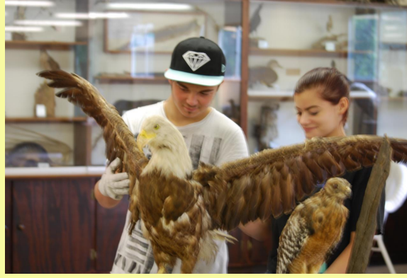
Past students cleaning mounts