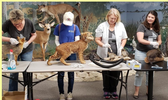
Past Waterman volunteers cleaning mounts

No entry fee is charged for this volunteer event.